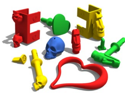
3D Printable dedicate items (Free download for Alfred owners)