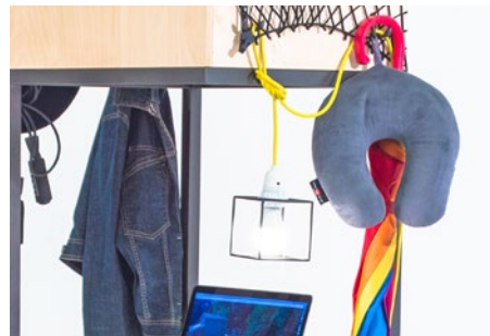
Integrated lamp with 4 mt cable