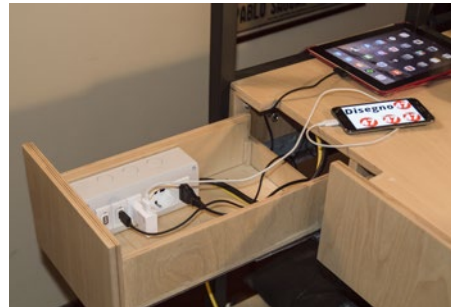
Integrated socket with 4 mt cable