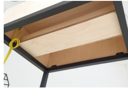
Hidden utility drawer