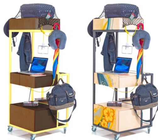
Custom graphic printing