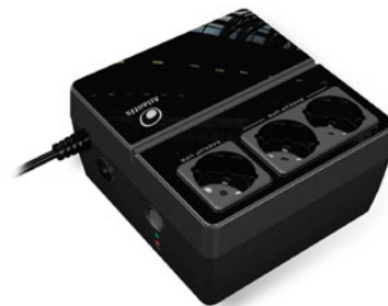
Integrated Atlantis UPS Unit Smart 700VA/300W