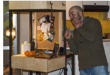
Addictional moveable noteboard