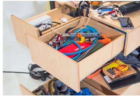
Central module with double drawer