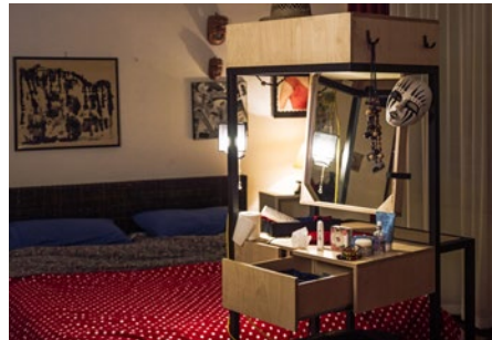
Addictional moveable mirror